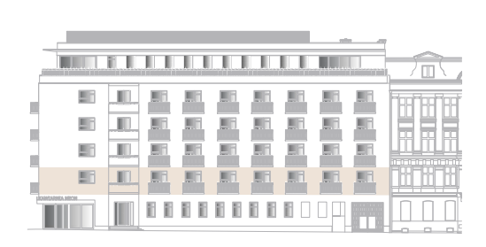
A 2 — Love where you live